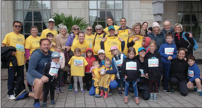
Team OMRA ready to hit the road for the 2K walk